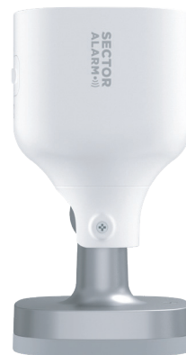
3. Outdoor HD Security Camera