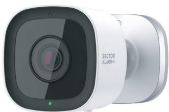
1. Indoor HD Security Camera