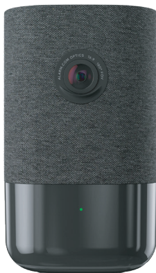
2. 180° HD Video Camera